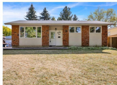
21 FERNWOOD CRES